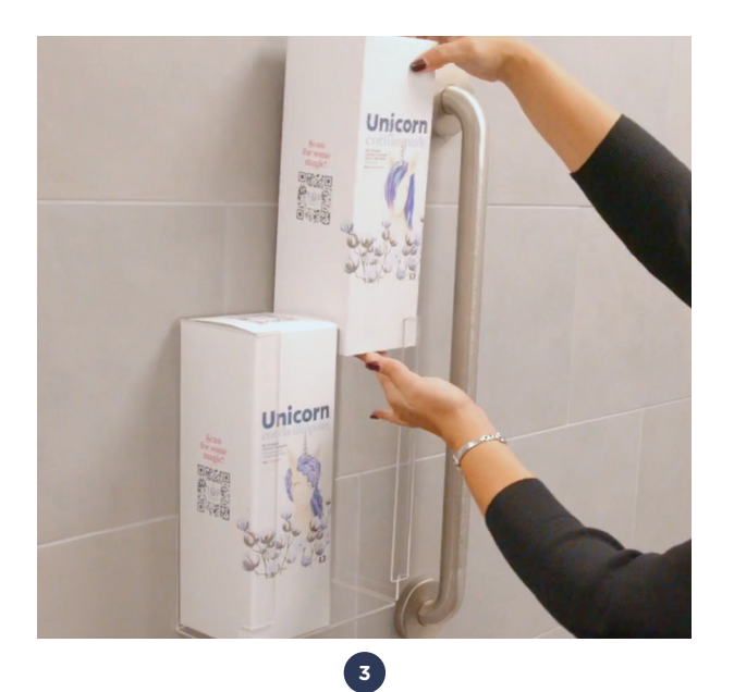
Slide product cartridges in the acrylic dispenser from the top.

Remove protective film wrap from exterior of dispenser. Apply 2 pieces of doubled sided tape to the back of acrylic dispenser going vertically.